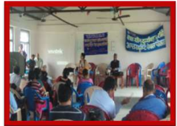
Glimpse of Teachers training and Street drama