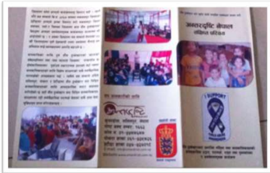
Publications, done with the help of Danish Embassy.