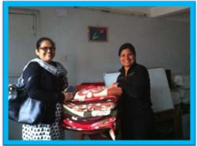
Supports from generous people around