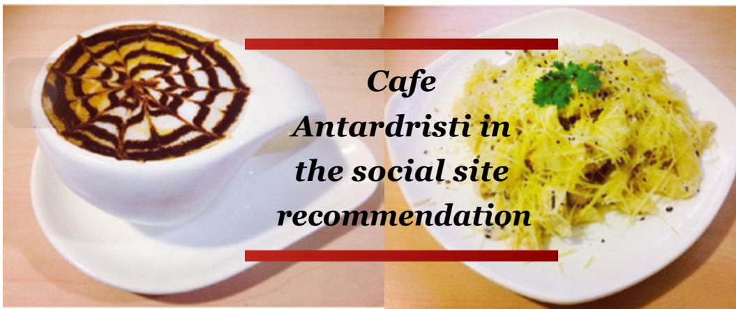
Cafe Antardristi in the social site recommendation