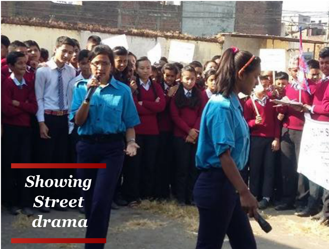
Showing Street drama